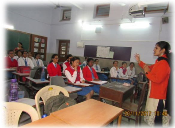
Ms. Sneha describes the way to discover the meaning in one's life

Life Skills are a popular program today conducted by many. But DB ARK has a focus of its own: 'How to communicate and relate with God.' List of Life-Skills is incomplete with out the Spiritual Dimension !